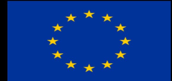
Dedicated Office covering European Union (EU), 2026