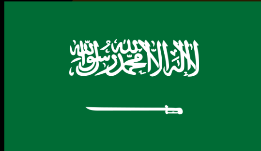
Saudi Arabia, 2023